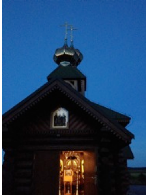
At the Skete of SS. Anthony and Theodosius

it would go out and we could have experienced the night in all of its wild glory. Then there was the simplicity and strength of the three sisters.